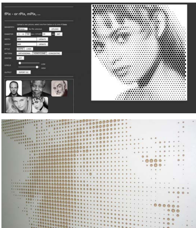
Mathias Bernhard's fPix generator

All codes in this tutorial are also saved in 'tutorial-05_processing - codes'.